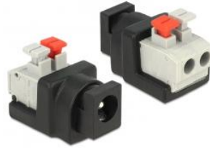
65524 Delock Adapter DC 5.5 x 2.1 mm female > Terminal Block with push button 2 pin