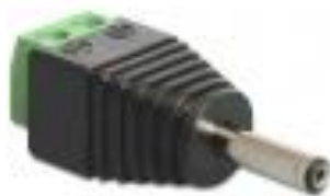
65434 _Delock Adapter DC 1.3 x 3.5 mm male > Terminal Block 2 pin