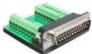
65318 Delock Adapter Sub-D 25 pin male > Terminal Block 27 pin