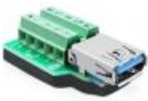
65370 Delock Adapter USB 3.0-A female > Terminal Block 10 pin