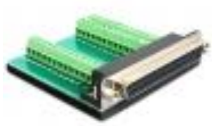
65319 Delock Adapter Sub-D 37 pin female > Terminal Block 39 pin