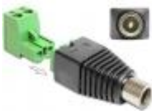
65486 _Delock Adapter DC 2.5 x 5.5 mm female > Terminal Block 2 pin 2-part