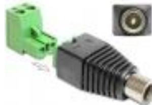
65423 _Delock Adapter DC 2.1 x 5.5 mm female > Terminal Block 2 pin 2-part