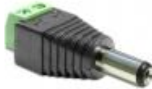
65396 _Delock Adapter DC 2.1 x 5.5 mm male > Terminal Block 2 pin