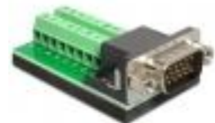
65424 _Delock Adapter VGA male > Terminal Block 16 pin