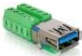
65167 Delock Adapter USB 3.0-A female > Terminal Block 10pin