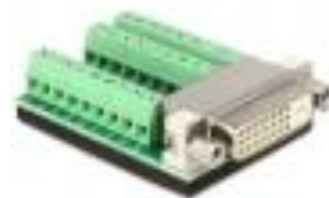
65169 Delock Adapter DVI 24 female > Terminal Block 27pin