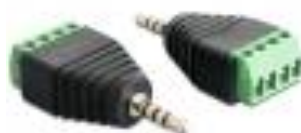
65454 _Delock Adapter Stereo jack male 2.5 mm > Terminal Block 4 pin