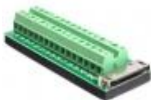
65442 _Delock Adapter iPhone 30 pin female > Terminal Block 32 pin