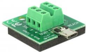
65597 Delock Adapter Micro USB male > Terminal Block 6 Pin