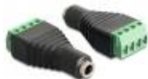
65457 _Delock Adapter Stereo jack female 3.5 mm > Terminal Block 4 pin