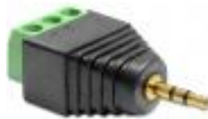
65420 _Delock Adapter Stereo jack male 2.5 mm > Terminal Block 3 pin