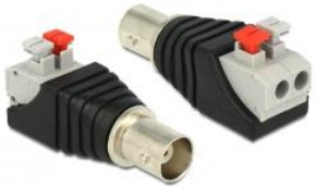
65526 Delock Adapter BNC female > Terminal Block with push button 2 pin