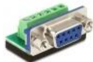
65498 _Delock Adapter Sub-D 9 pin female > Terminal block 6 pin