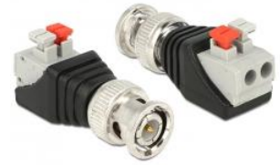
65525 Delock Adapter BNC male > Terminal Block with push button 2 pin