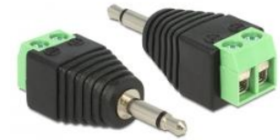
65528 Delock Adapter Stereo jack male 3.5 mm > Terminal Block 2 pin