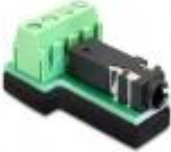
65395 _Delock Adapter Stereo jack 3.5 mm female 4 pin > Terminal Block 4 pin