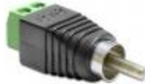
65417 _Delock Adapter RCA male > Terminal Block 2 pin