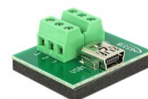
65518 _Delock Adapter Micro USB female > Terminal block 6 pin