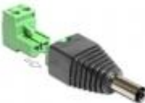
65422 _Delock Adapter DC 2.1 x 5.5 mm male > Terminal Block 2 pin 2-part