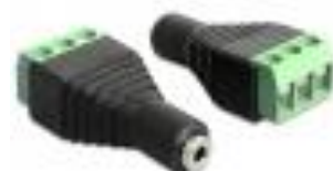
65456 _Delock Adapter Stereo jack female 2.5 mm > Terminal Block 3 pin