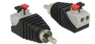
65566 Delock Adapter RCA male > Terminal Block with push button 2 pin