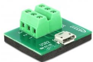
65517 _Delock Adapter Micro USB female > Terminal block 6 pin