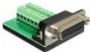
65274 Delock Adapter Sub-D 15 pin Gameport female > Terminal block 16 pin