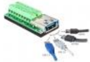
65405 _Delock Adapter Multiport USB 3.0 + eSATApd female > Terminal Block 18 pin