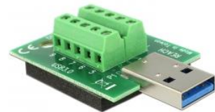
65639 Delock Adapter USB 3.0-A male > Terminal Block 10 Pin