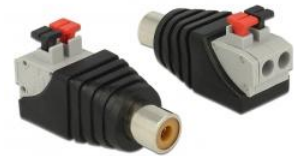
65565 Delock Adapter RCA female > Terminal Block with push button 2 pin