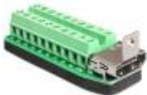
65168 Delock Adapter HDMI female > Terminal Block 20pin