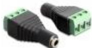
65455 _Delock Adapter Stereo jack female 3.5 mm > Terminal Block 3 pin