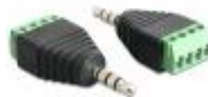
65453 _Delock Adapter Stereo jack male 3.5 mm > Terminal Block 4 pin