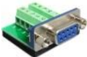
65268 Delock Adapter Sub-D 9 pin female > Terminal block 10 pin