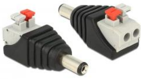
65523 Delock Adapter DC 5.5 x 2.1 mm male > Terminal Block with push button 2 pin