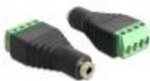
65458 _Delock Adapter Stereo jack female 2.5 mm > Terminal Block 4 pin