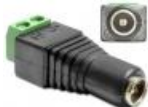
65485 _Delock Adapter DC 2.5 x 5.5 mm female > Terminal Block 2 pin