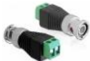
65323 Delock Adapter BNC male > Terminal Block 2 pin