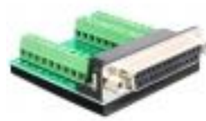
65317 Delock Adapter Sub-D 25 pin female > Terminal Block 27 pin