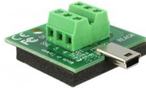
65638 Delock Adapter Mini USB male > Terminal Block 6 Pin