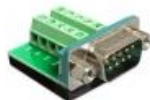
65269 Delock Adapter Sub-D 9 pin male > Terminal block 10 pin