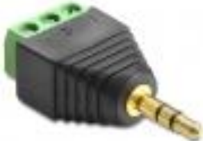
65419 _Delock Adapter Stereo jack male 3.5 mm > Terminal Block 3 pin