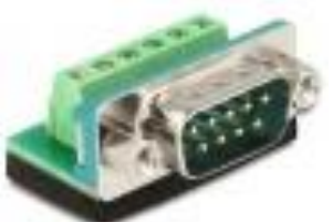
65499 _Delock Adapter Sub-D 9 pin male > Terminal block 6 pin