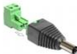
65488 _Delock Adapter DC 2.5 x 5.5 mm male > Terminal Block 2 pin 2-part