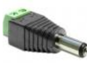
65487 _Delock Adapter DC 2.5 x 5.5 mm male > Terminal Block 2 pin