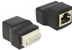
65527 Delock Adapter RJ45 female > Terminal Block with push button 8 pin