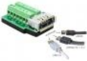
65392 _Delock Adapter eSATApd female > Terminal Block 14 pin