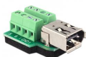
65495 _Delock Adapter FireWire 6 female > Terminal Block 2 pin