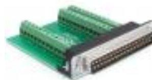
65320 Delock Adapter Sub-D 37 pin male > Terminal Block 39 pin