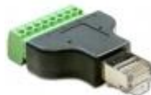
65389 Delock Adapter RJ45 male > Terminal Block 8 pin 2-parts