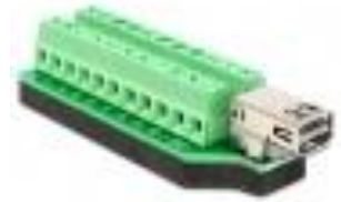
65394 _Delock Adapter Mini Displayport female > Terminal Block 22 pin