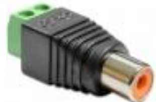
65418 _Delock Adapter RCA female > Terminal Block 2 pin