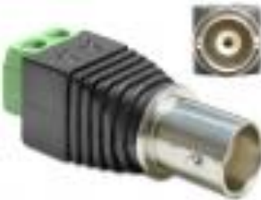
65416 _Delock Adapter BNC female > Terminal Block 2 pin