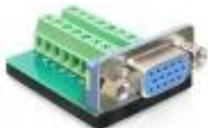
65170 Delock Adapter VGA female > Terminal Block 16pin