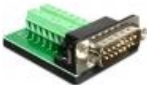
65275 Delock Adapter Sub-D 15 pin Gameport male > Terminal block 16 pin