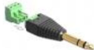
65460 _Delock Adapter Stereo jack male 6.35 mm > Terminal Block 3 pin 2-part