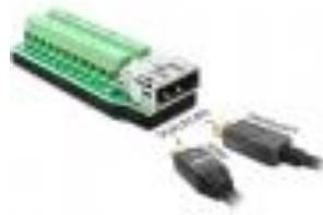
65393 _Delock Adapter Dualport HDMI + Displayport female > Terminal Block 22 pin