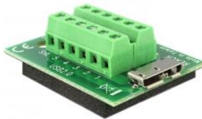
65641 Delock Adapter Micro USB 3.0 female > Terminal Block 12 Pin