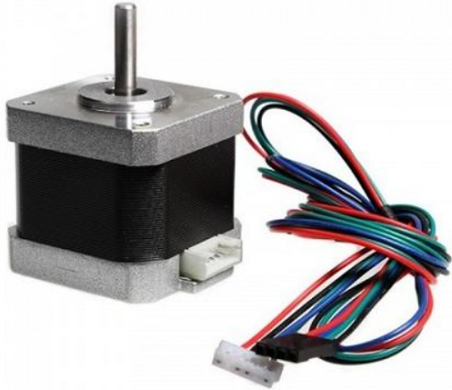
DMT001 MOTOR PASO A PASO 42HB34T08A/B (NEMA17)