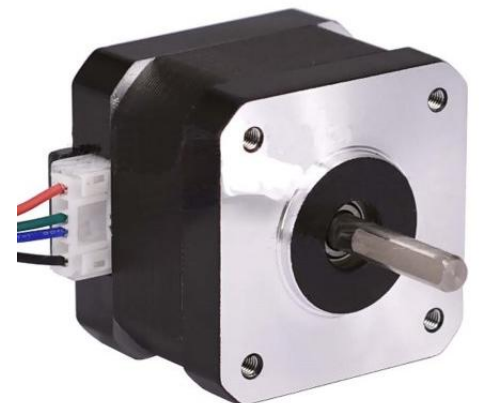
DMT009 MOTOR PASO A PASO 42BYGH34 (NEMA17)