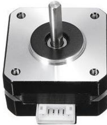
DMT002 MOTOR PASO A PASO 17HS4023 12V (NEMA17)