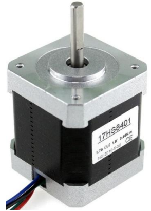
DMT003 MOTOR PASO A PASO 17HS8401B 2-18V (NEMA17)