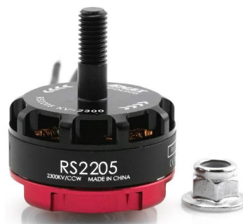
MT0204 MOTOR RS2205 AVIONICA CCW