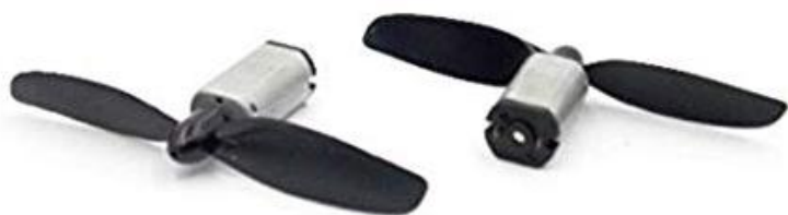
MT0200 MOTOR N30 AVIONICA CON HELICES