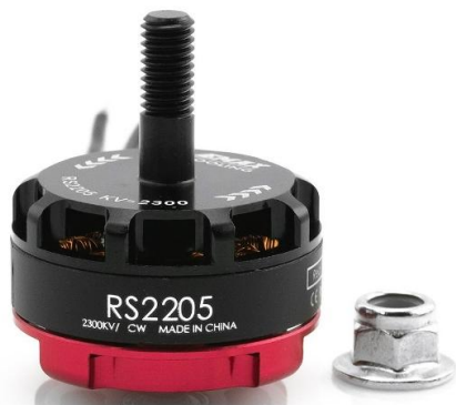
MT0203 MOTOR RS2205 AVIONICA CW