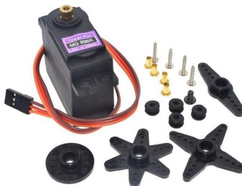
MT0031 SERVO METAL DIGITAL MG996R 360° 4.8 V - 7.2 V