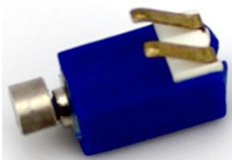
MT0007 MICROMOTOR 3V VIBRACION 4x8 mm