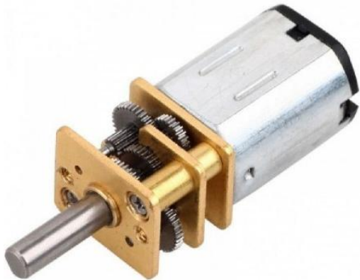
MT0010/1000 MOTOR 6 DC 12NF20 1000RPN 1:100