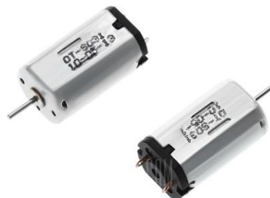
MT0201 MOTOR N30 AVIONICA 8000 RPM