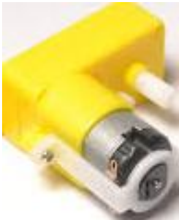
MT0012 MOTOR REDUCTOR 3-12 VDC 83RPN 1:120