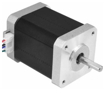
3D0119 SOPORTE L MOTORES NEMA 17 SERIE 42