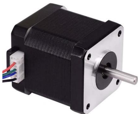
DMT007 MOTOR PASO A PASO 42BYGH47-1704B DOBLE EJE 12V/1.68A 42 mm (NEMA17)