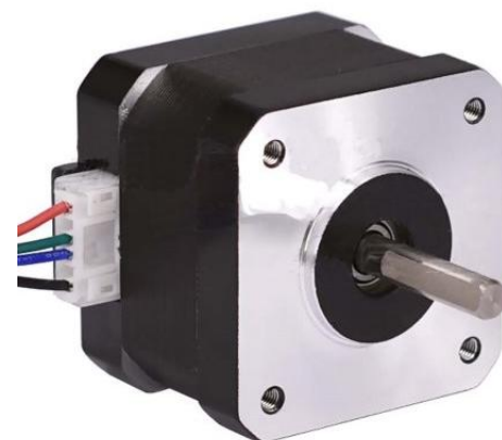
DMT009 MOTOR PASO A PASO 42BYGH34 (NEMA17)