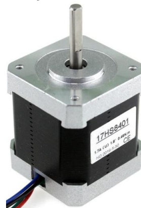
DMT003 MOTOR PASO A PASO 17HS8401B 2-18V (NEMA17)