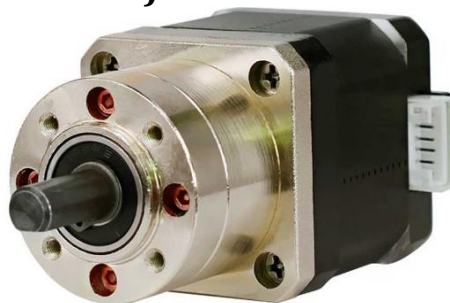
DMT008 MOTOR PASO A PASO 17HS4401P-PG518 REDUCTOR 5.18:1 12V (NEMA17)