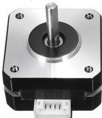
DMT002 MOTOR PASO A PASO 17HS4023 12V (NEMA17)