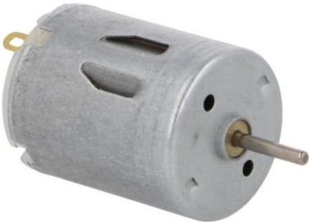
MT0001 MOTOR 8.5 - 15 VDC 6900 RPM