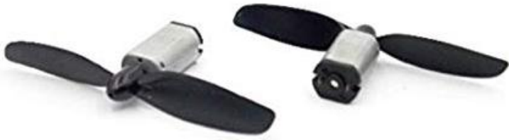
MT0200 MOTOR N30 AVIONICA CON HELICES