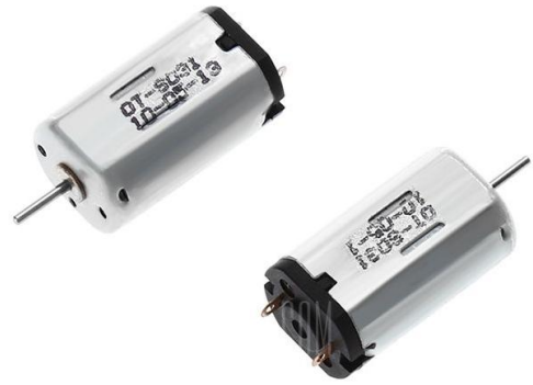
MT0201 MOTOR N30 AVIONICA 8000 RPM