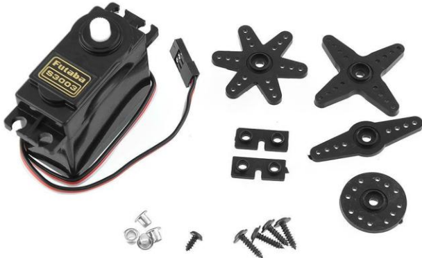
MT0025 SERVO S3003 FUTABA 180° 4.8 V