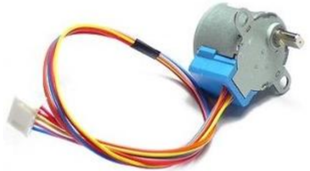
MT0026 MOTOR PASO A PASO 5 VDC 0.5 W 28BYJ-48