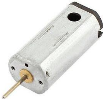
MT0004 MICROMOTOR 3.7 - 7 VDC 31000 RPM