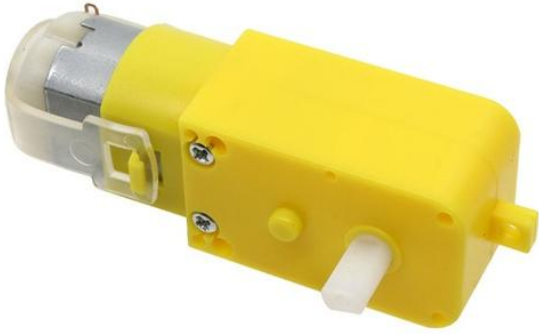
MT0011 MOTOR REDUCTOR 5 VDC 83RPN 1:120