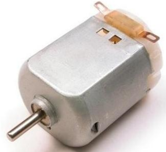
MT0002 MOTOR 3 - 6 VDC 3000 RPM