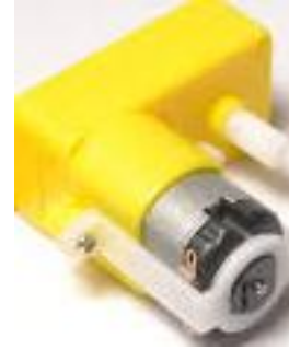
MT0012 MOTOR REDUCTOR 3-12 VDC 83RPN 1:120