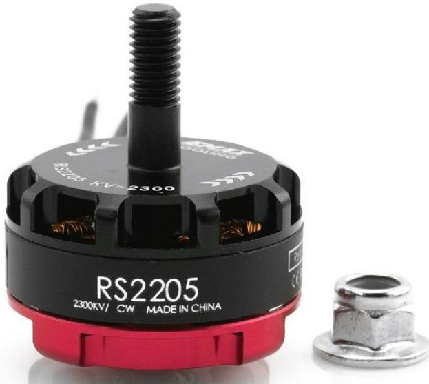
MT0203 MOTOR RS2205 AVIONICA CW