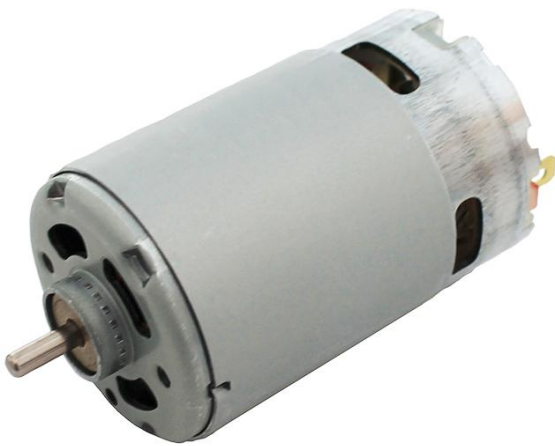
MT0028 MOTOR 12VDC ALTA PÒTENCIA RS550