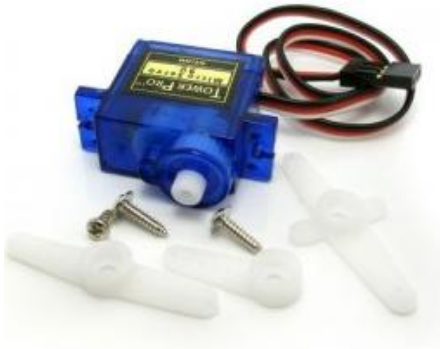
CP0019 SG90 MICRO MOTOR 9G 90°