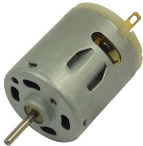
MT0029 MOTOR 6-12 VDC 5000 RPM RS365