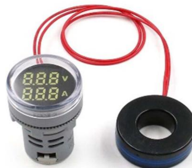
MD9156 VOLTIMETRO AMPERIMETRO LED 12-500 V