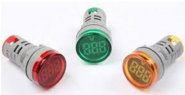
MD9157 VOLTIMETRO LED ROJO 12-500 VAC