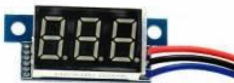
FB1035 MINI VOLTIMETRO DIGITAL 0-30V