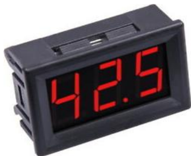
MD9108 VOLTIMETRO LED ROJO 0-100V 0.56"