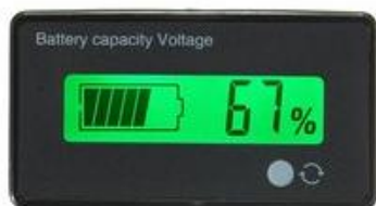
VOLT1209820 INDICADOR CAPACIDAD LCD 12/24/36/48 V