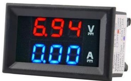
MD9059 DISPLAY VOLTIMETRO AMPERIMETRO 100V 10A