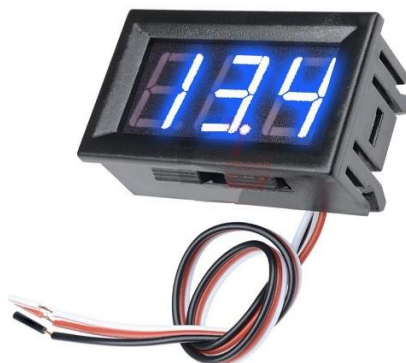
MD9182 VOLTIMETRO LED AZUL 0-100V 0.56"