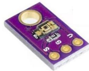
MD9052 SENSOR LUZ AMBIENTE CJMCU-TEMT6000