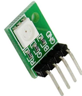
MD9053 MODULO LED RGB FULL COLOR