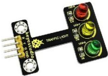
KY0310 MODULO SEMAFORO LED