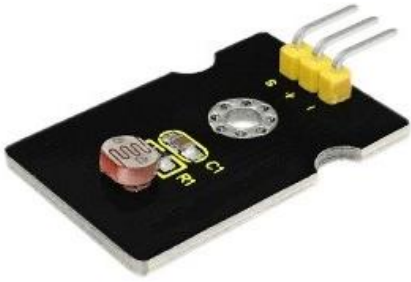
KS0028 SENSOR DE LDR