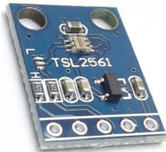
MD9014 MODULO SENSOR INTENSIDAD LUMINOSA TSL2561